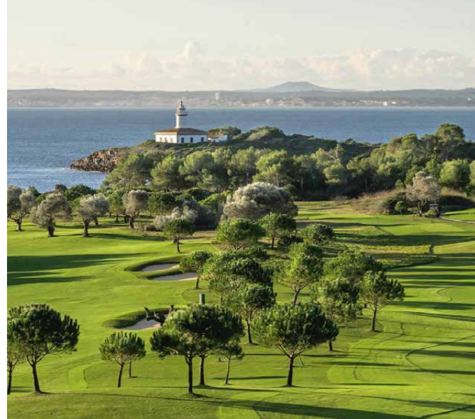
Club de Golf Alcánada

The Carrossa Resort “reigns” on one of the gentle Llevant hills – far away from mass tourism, yet still in a central location to ensure a varied active holiday.